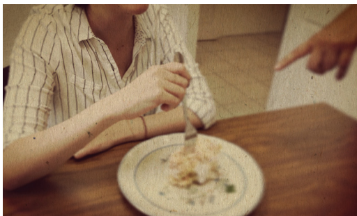
CENTRO DE LOS DERECHOS DEL MIGRANTE, INC.

As a general matter, au pairs report that the program fails to guarantee access to the basic material needs and services promised under the J-1 au pair program. Despite program requirements that host families guarantee transportation to classes, 65 some au pairs interviewed for this report stated that they did not have access to transportation to attend their required classes or to leave the house on their days off. 66 Although host families are also required to provide au pairs with a private bedroom and meals, 67 some au pairs reported that their host families offered them shared or inadequate living quarters,