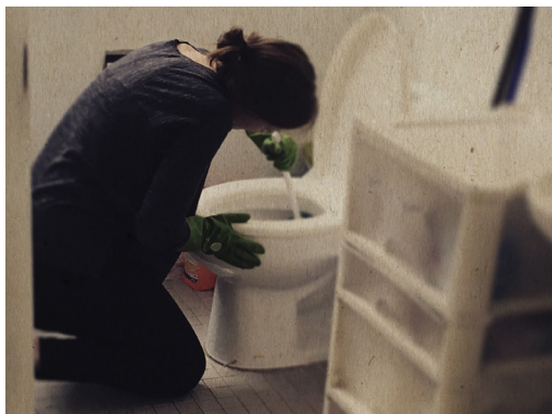
CENTRO DE LOS DERECHOS DEL MIGRANTE, INC.

Au pairs interviewed for this report describe their initial attraction to the au pair program’s three advertised components: to enjoy an immersive experience in American culture, to strengthen their English or other skills through academic coursework, and to provide childcare services as a part of their host families. In practice, however, all interviewees found work to be the central focus of the program: in many cases, J-1 au pairs described performing childcare activities to such an extent and at such a low cost that it compromised their ability to participate in