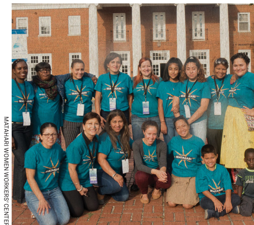
Domestic workers from Matahari Women Workers’ Center, a member of the National Domestic Workers’ Alliance, spearheaded advocacy efforts to pass the Domestic Workers Bill of Rights in Massachusetts. Governor Deval Patrick signed the bill into law in July of 2014.

Generally, domestic workers enjoy far fewer labor rights than other workers. The lack of labor protections for domestic workers is rooted in the history of the Fair Labor Standards Act (FLSA), the landmark 1938